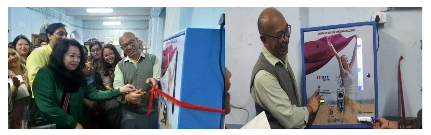
Awareness Programme on Use of Sanitary Pad Vending Machine